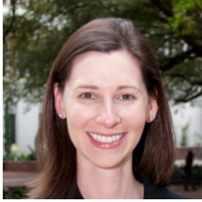
Florida State University