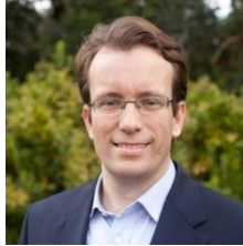
Chair At Large

The Board consists of seven volunteers, selected as listed in the captions below. At large members are chosen by the Board. To serve on the Board, you must be a registered voter in Tallahassee and preferably have some knowledge of government ethics. Board members are required to file annual financial disclosure documents with the Supervisor of Elections.