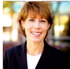
Vice Chair State Attorney's Office 2 nd Judicial Circuit