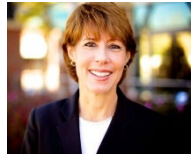
Gwen Graham Vice Chair