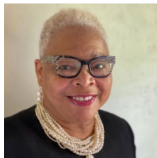
Public Defenders Office, 2 nd Judicial Circuit