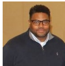
Past Chair Florida A&M University

Gwen Graham is an activist for women's issues, public education, the environment, and ethics in government. Gwen served as the Congressional representative from Florida's 2 nd District during the 114 th Congress and was a Democratic candidate for Governor of Florida in 2018. She is an attorney and prior to her service in Congress, practiced law in Washington, D.C., and Tallahassee, Florida. In Tallahassee, she focused her practice on supporting public education as the lawyer for the Leon County School District. Gwen has worked on several presidential campaigns, and in 2004 served as Secretary John Kerry's surrogate coordinator in Florida. In addition to the City of Tallahassee Independent Ethics Board, Gwen currently serves on the Board of Unite the Country, Florida State Parks Foundation, Ruth's List, and is a member of the 38th Leadership Florida class. Her proudest accomplishments are her three children, and she is thankful for the opportunity to have been a PTA and band mom while they were young.