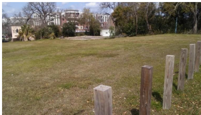
Site of Proposed Grocery Store Option

The CRA Board approved $281,660 in grant funding for initial planning, concept development and site study by the FRP as they refined their proposal. In May 2019, the CRA issued notice of intent to sell its properties in the 400 block of W. Virginia and W. Tennessee Streets. On June 27, 2019, the CRA received two proposals from the Tony Brown Consulting Group (TBCG), who is collaborating with the Bethel Missionary Baptist Church and at least one other member of the Frenchtown Redevelopment Partners on the proposed redevelopment of the CRA and privately-owned adjacent properties. The first proposal was for the purchase of the property at 431 W. Virginia Street, which would be assembled with a small strip mall on the eastern end of the block owned by the Bethel Foundation. The proposed development includes affordable senior housing with parking and an urgent care center/clinic with parking. The second proposal is to purchase the remaining five CRA parcels that used to comprise the former shelter and FRCC properties. There were