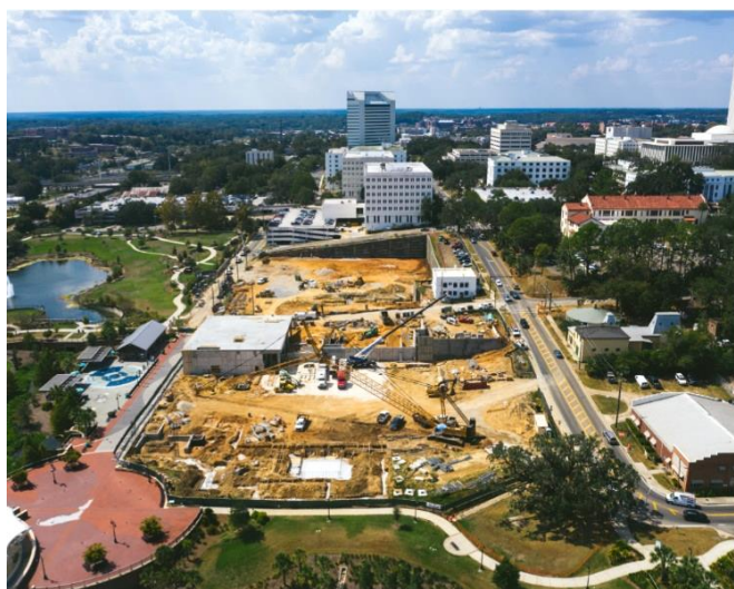
Cascades Project Site, September 2019

The pad for the AC Hotel was sold to the Marriott International Hospitality Company (Marriot Hotels) in August 2019. The estimated completion date for the Phase I improvements (the Firestone site) is late 2020. The estimated