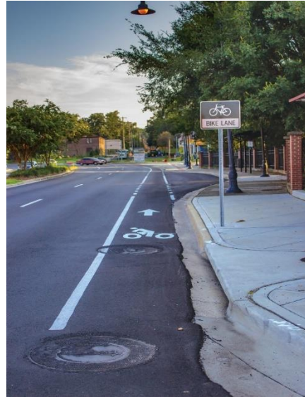
Bike Lanes on Macomb Street

The CRA funds were provided to help fund, design and implement some of the recommendations from the Frenchtown Placemaking Plan. The plan was the result of a year-long community engagement effort by the City's Planning Department, with assistance from other city departments and the CRA, that began in FY 2018. Towards the end of FY 2019, the planning implementation efforts were expanded to include the preparation of the Frenchtown Neighborhood First Plan, a multistep planning process led by the City's Neighborhood Affairs division designed to assist neighborhoods with developing an action plan to address community priorities. The plan currently consists of the projects listed below but will be expanded and will include specific strategies and action items as part of the Neighborhood First Plan, which is expected to be adopted by the end of FY 2020.